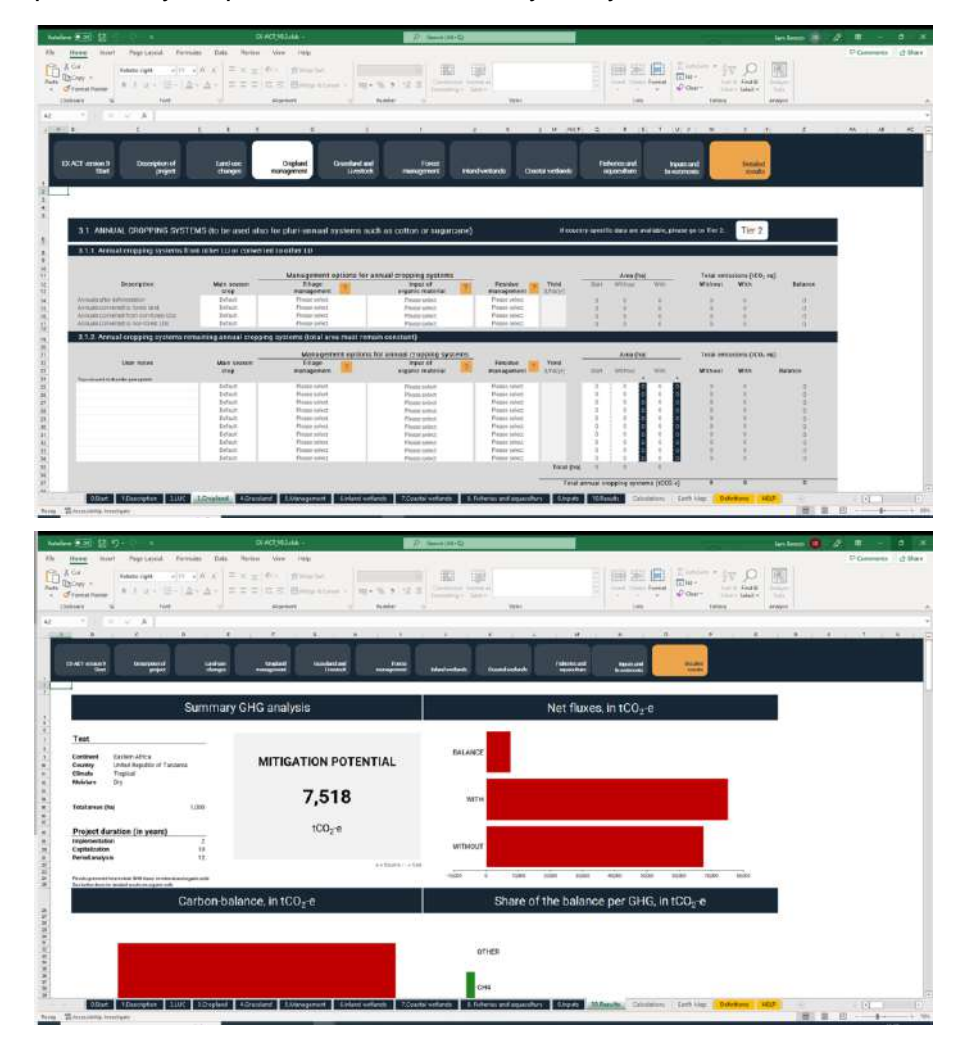
Figure 4 Interface of EX-ACT, a greenhouse gas accounting tool.

Model predictions alone may be useful, but the most credible analyses will also make efforts to validate model predictions. This can involve field measurements to test predictions, or efforts to better quantify important model parameters. Useful methods exist for this process, including model sensitivity analysis to identify parameters to which model predictions are particularly responsive, and uncertainty analysis to estimate a confidence range for results.