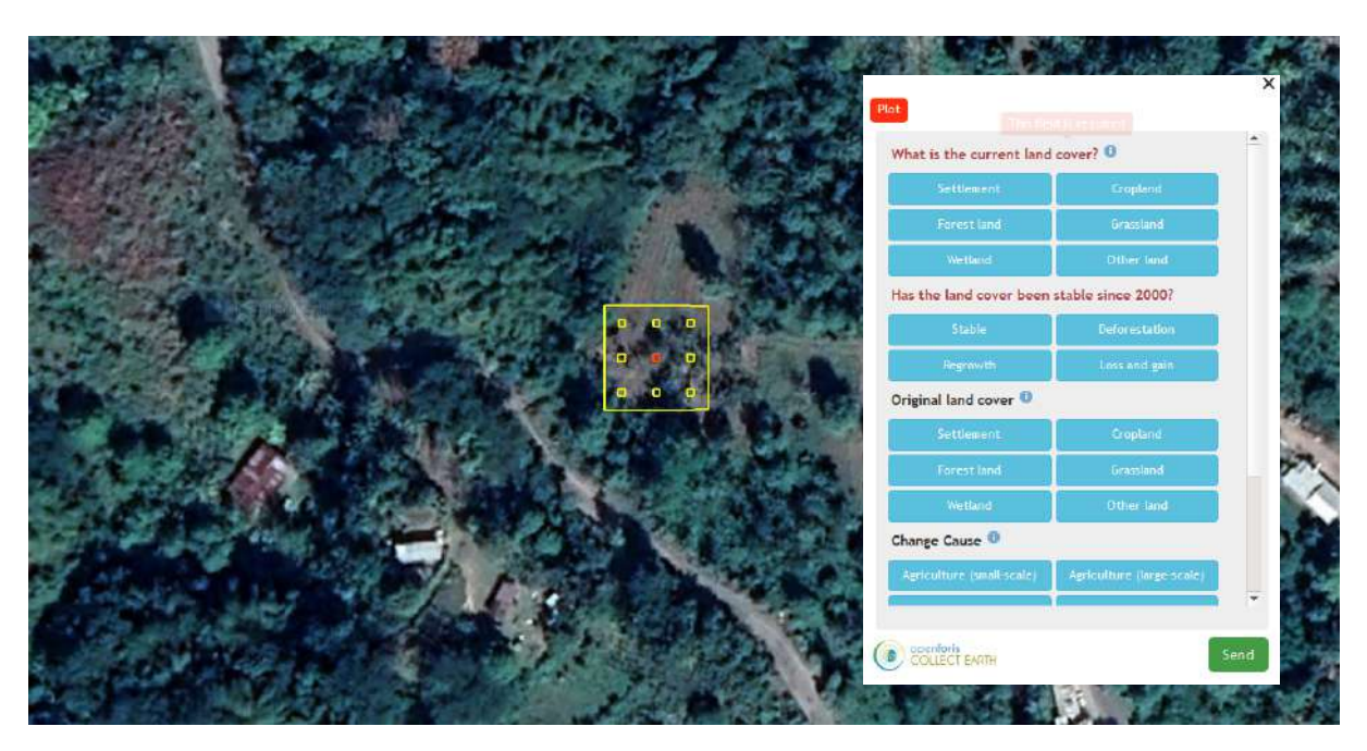
Figure 3 A Collect Earth sample plot overlaid on high-resolution imagery from Google Earth. Data collection requires users to visually interpret the imagery (e.g. to identify restoration indicators) at 100s - 1000s of sample locations.