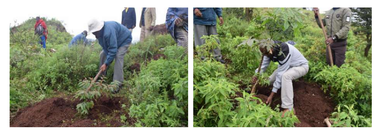
Figure 6 Examples of tree planting supported by MVIWAARUSHA.

The Network of Farmers and Pastoralist Groups in Arusha Region (Mtandao wa Vikundi vya Wakulima na Wafugaji Mkoa wa Arusha - MVIWAARUSHA) is an FFPO based in northern Tanzania. The organisation aims to strengthen farmer's groups and improve their coordination to achieve social and economic development goals. MVIWAARUSHA facilitates the exchange of knowledge, skills, and experience on farming and livestock keeping activities. Their activities are spread across Arusha region with ~12,000 members including crop growers, livestock keepers, gatherers, beekeepers and fishermen. Management interventions relevant to restoration include tree planting on farmland (Figure 6) and the promotion of agroforestry.