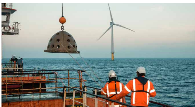
Pilot Rich North Sea by NGO Nature and Environment / Foundation The Nordsea in collaboration with ASN Bank