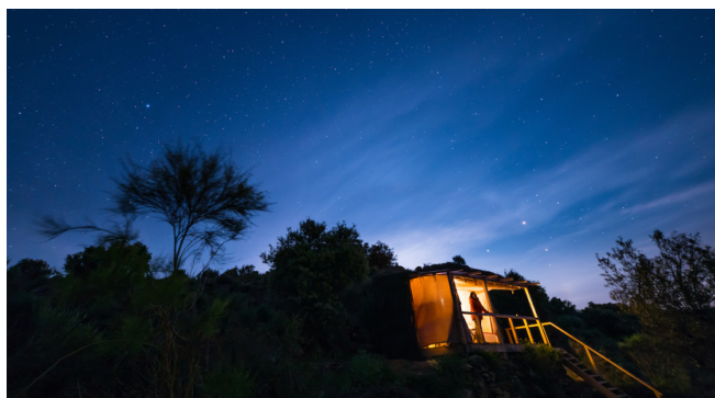
Eco-tourism as part of the Rewilding Europe project , financed by an NCFE loan to Rewilding Europe Capital