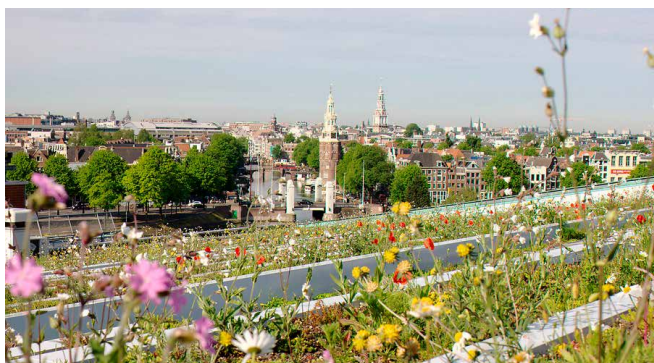
Green Deal on Green Roofs , building a multiple business case with nature roofs