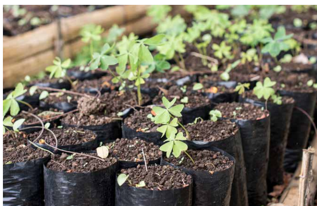
Nursery of coffee producer Casal , an end-borrower of the eco.business Fund in El Salvador

The worldwide scale of funding for biodiversity and ecosystem services in 2010 was estimated at USD 51 to USD 53 billion per annum, of which USD 21 billion was spent in developing countries 5 . However, worldwide, CBD estimated that there is a need for between USD150 and USD 440 billion per annum to meet the 2020 Aichi targets set by the CBD. This represents just 0.2 to 0.6 per cent of the estimated USD 73 trillion of global GDP 6 .