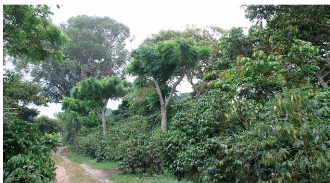
Shade-grown coffee production by Tejemet , an end-borrower of the eco.business Fund in El Salvador